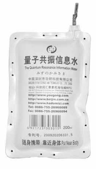
Bag of 200 ml